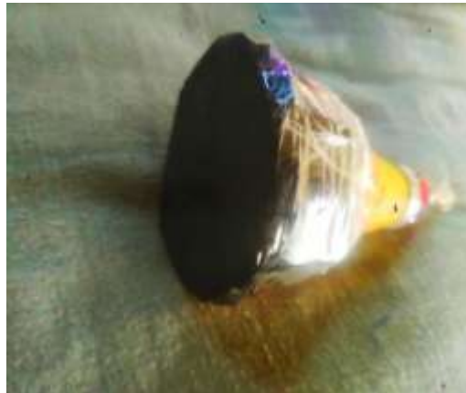
Figure 2: Its the Equipment which is a photo- electronic device name is Insoul-T

Its Emmits Signal with required frequency for treatment as proceser of chemical reaction in body